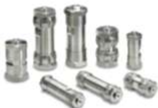
Waters Prep C80 ® columns

This course covers fundamentals chromatographic knowledge, offers a solid understanding of HPLC and provides the necessary information to help make informed choices about chromatographic experiments. Basic chromatographic troubleshooting is taught using examples of separation problems